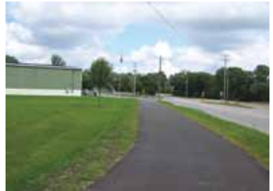
(New T&C Path – Section along Oak Street (between Lake Drive and Connie Avenue))