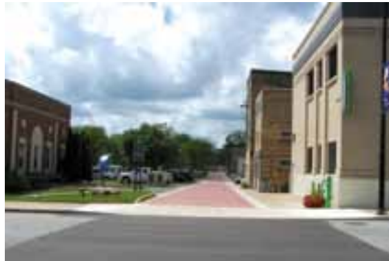
(Alley between Post Office and Huntington Bank.)

Avenue ➤ Middle School entrance from Lake Dr. to the school